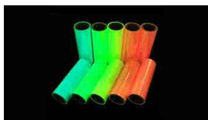
Film (PVC, PET)